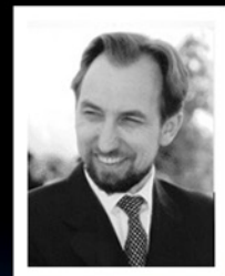
Jordanian UN Ambassador HRH Prince Zeid Ra'ad