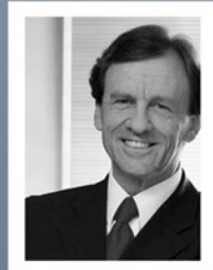
Former UN Ambassador Allan Rock