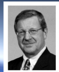
Nobel Peace Prize Nominee Lloyd Axworthy