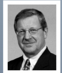
Nobel Peace Prize Nominee Lloyd Axworthy