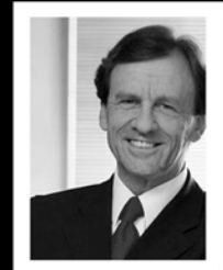
Former UN Ambassador Allan Rock